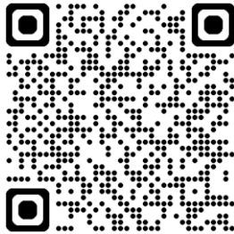
CWMP Club Med Store